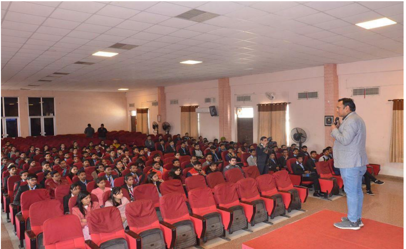
Seminar on GATE Training by Engineers Academy